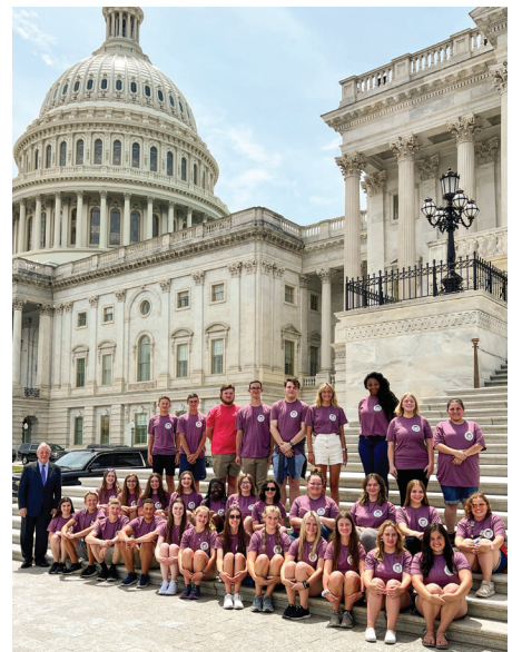
Students pictured with Senator Durbin

Since 1964, the nation’s cooperative electric utilities have sponsored more than 60,000 high school students to visit Washington, D.C., talk one-on-one with their U.S. congressional delegations and learn from energy and grassroots government education sessions. NRECA is the national service organization representing the nation’s more than 900 consumer-owned, not-for-profit electric cooperatives, which provide service to 42 million consumer-members in 47 states.