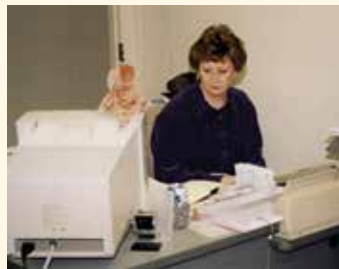
Technology starting to boom.

Norris Electric made the jump into the 21st century. Technology had exploded giving Norris unlimited resources and data to enhance the jobs of our employees and enrich the lives of our Members.