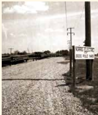
Moved pole yard from Boos corner to current location at headquarters.