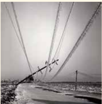
Worst ice storm in the history of NEC - 12 days to restore power to members with 1,000 poles knocked down.