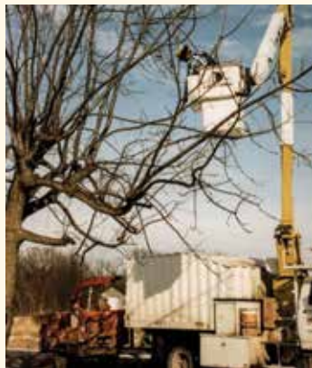
First tree trimming bucket truck.