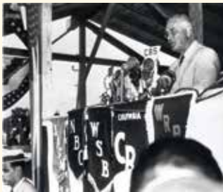
The Next Greatest Thing

President Franklin D. Roosevelt signed an executive order that lit up the lives of people across the land by creating the Rural Electrification Administration.