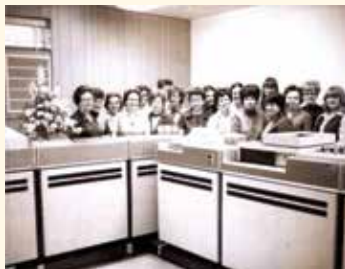
First computer system was introduced to Norris employees.